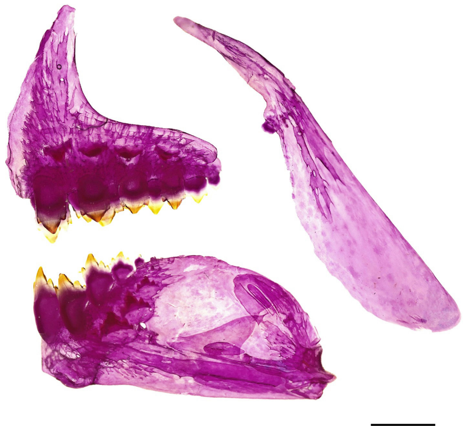
FIGURE 2 | Astyanax pintacua , UFOPA-I 1634, paratype, 46.4 mm SL (c&s). Left side of the premaxillary, maxillary, and dentary. Lateral view. Scale bar = 1 mm.

Dorsal-fin rays ii,9*(41). Dorsal-fin origin at midbody, slightly posterior to vertical through pelvic fin origin. First unbranched ray approximately half length of second unbranched ray. Adipose fin present, origin approximately vertical through base of 23rd to 24th branched anal-fin rays. Pectoral-fin rays i,10(9), i,11*(27), i,12(5); tip of pectoral fin reaching pelvic-fin origin when compressed. Pelvic-fin rays i,7*(41); tip of pelvic