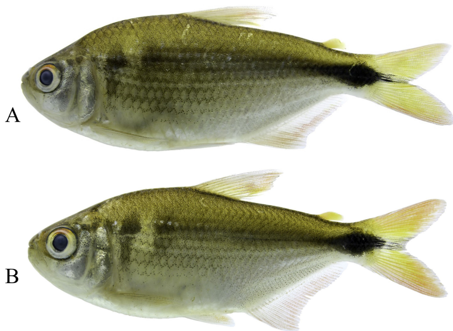
FIGURE 1 | Astyanax pintacuia : A. UFOPA-I 1747, holotype, 66.9 mm SL; B. UFOPA-I 1745, paratype, 50.8 mm SL. Brazil, Pará State, Monte Alegre, igarapé Mulato.

Diagnosis. Astyanax pintacuia differs from its congeners, except A. lineatus , A. kullanderi Costa, 1995 and A. superbus Myers, 1942 by presenting wavy dark stripes between the rows of scales on the sides of the body, forming a well-defined longitudinal striped pattern ( vs. absence of a wavy, striped pattern in the remaining congeners). Astyanax pintacuia differs from A. lineatus , A. kullanderi , and A. superbus in the greater number of gill rakers on the first branchial arch (26–28 vs. 19 or 20 in A. kullanderi , 22–24 in A. lineatus and 22 or 23 in A. superbus ). Astyanax pintacuia can be diagnosed from A. kullanderi and A. superbus by presenting two vertically elongated humeral blotches ( vs. presence of a single, horizontally elongated, oval-shaped humeral blotch). Astyanax pintacuia also differs from A. kullanderi by the number of scales in the lateral line (37–40 vs. 31–32). Additionally, the new species differs from A. superbus by presenting a short maxilla, not reaching the vertical that passes through the anterior margin of the pupil