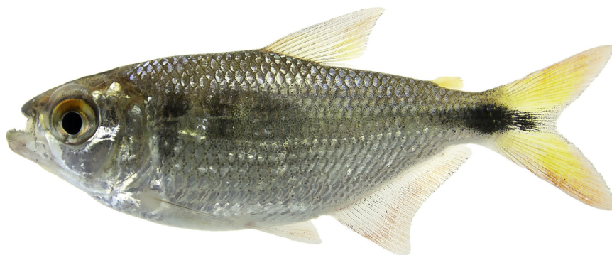
FIGURE 3 | Astyanax pintacui , UFOPA-I 1745, paratype, 45.1 mm SL, in life. Lateral view, left side.