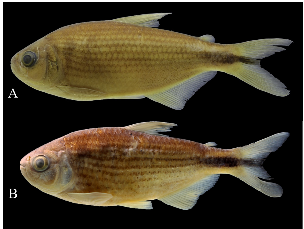
FIGURE 5 | Astyanax lineatus : A. ZUEC 6811, 74.7 mm SL, Brazil, Mato Grosso, Chapada dos Guimarães, rio Claro; B. ZUEC 18550, 69.1 mm SL, Brazil, Mato Grosso, Nortelândia, rio Santana.

Furthermore, at least three additional putative species belonging to the A. bimaculatus species complex have been recorded in the Northern Pará drainage system (JSA, 2025, pers. obs.). An integrative taxonomic approach of Astyanax species inhabiting the rivers of northern Pará is currently being conducted by JSA to assess the true diversity of the genus in the region.